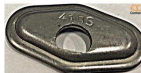
Sikking Plate Joggled AISI 304, 316, 410