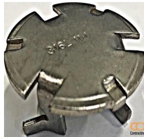
Tray Valve AISI 304, 316, 410