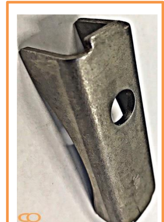
Universal Clamp AISI 304, 316, 410