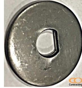
Flat D-Washer AISI 304, 316, 410