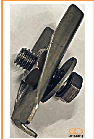
Manway Clamp with welded nut AISI 304, 316, 410