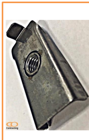
Manway Clamp AISI 304, 316, 410