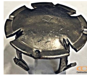
Flexifit Valve AISI 304, 316, 410