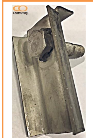
Manway Clamp with welded bolt AISI 304, 316, 410