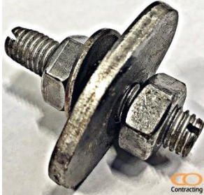
Complete Manway Assembly AISI 304, 316, 410