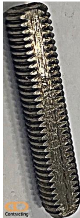
Manway D shape 1 side flatted Stud M10 AISI 304, 316, 410