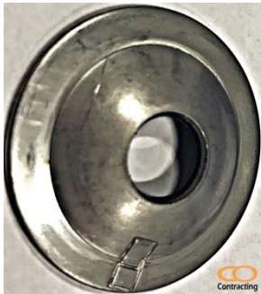
Domed Washer AISI 304, 316, 410