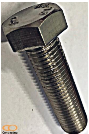
Bolt M8 – M24 AISI 304, 316, 410