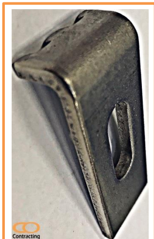
Demister Clamp AISI 304, 316, 410