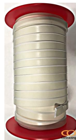
PTFE Gasket AISI 304, 316, 410