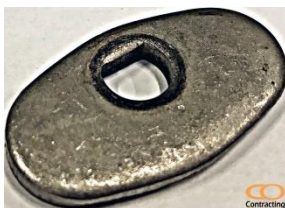
Manway Lock Clamp AISI 304, 316, 410