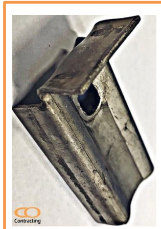
Single Lever Clamp AISI 304, 316, 410