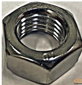
Nut M8 – M24 AISI 304, 316, 410