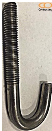
Demister J-Bolt AISI 304, 316, 410