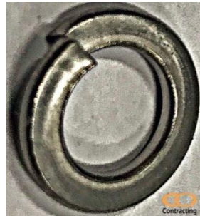
Lock Washer AISI 304, 316, 410