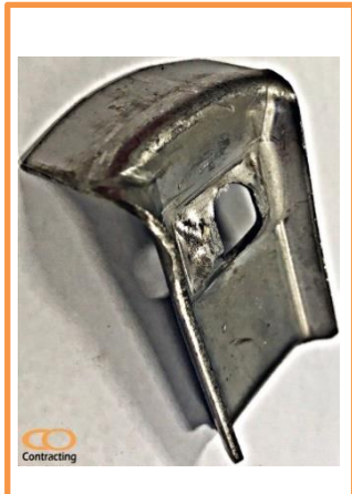
YD Clamp AISI 304, 316, 410