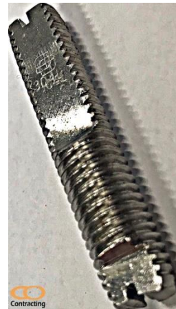
Manway Full Treaded Stud M10 AISI 304, 316, 410