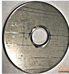
Flat Washer AISI 304, 316, 410