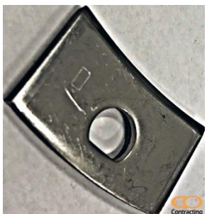
Manway Lock Clamp AISI 304, 316, 410