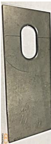
Seal Plate AISI 304, 316, 410