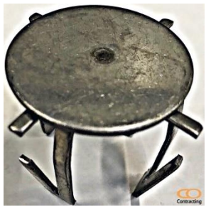
Snap-in Valve AISI 304, 316, 410